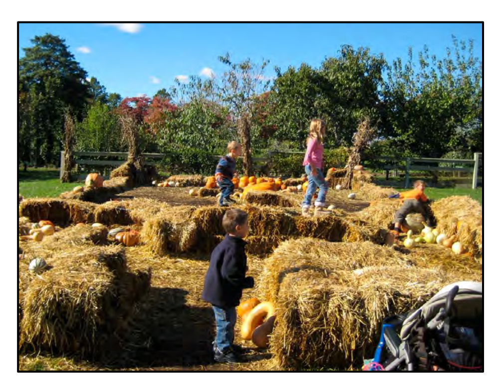
This temporary autumn landscape is in scale with young visitors! Longwood Gardens, Kennett Square, PA.