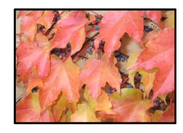
NGC CONVENTION, LOUISVILLE, KY