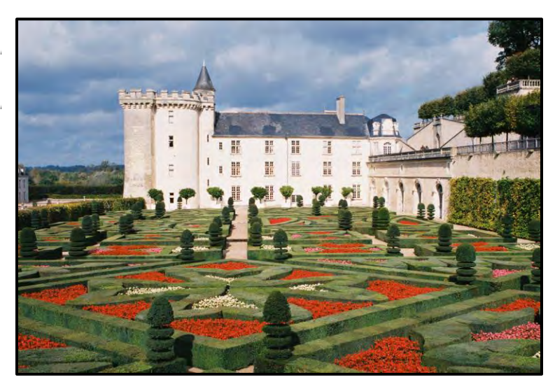
The Ornamental Garden