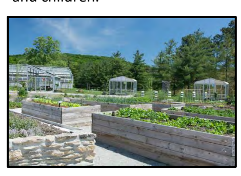
Edible Garden at Bernheim Research Forest and Arboretum

The Bernheim Edible Garden is a laboratory for regenerative design. This LEED Platinum building is a model in the region. They focus on energy production, not just energy reduction. They focus on being part of a healthy water cycle, not just water conservation. The facility creates wonderful learning experiences for adults and children.