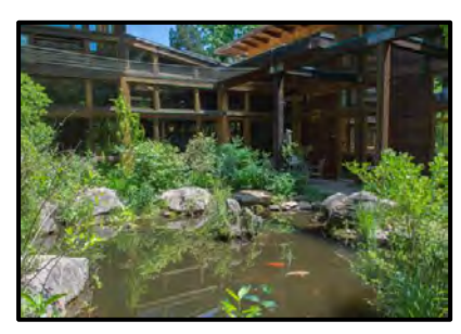
Visitor's Center at Bernheim Research Forest and Arboretum, Clermont, KY.

to the natural state for that area. In 1931 the Frederick Law Olmsted Firm of Brookline, Massachusetts, at that time run by Frederick Law Olmsted Jr., designed the 600-acre arboretum. The extensive plan included the creation of three lakes. The arboretum was opened to the public in 1950.