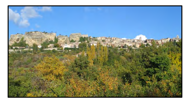
Saignon, a hill top village in Provence, France