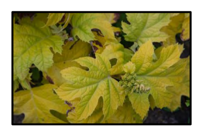
Little Honey Oakleaf Hydrangea (Hydrangea quercifolia 'Little Honey', Yew Dell Gardens.