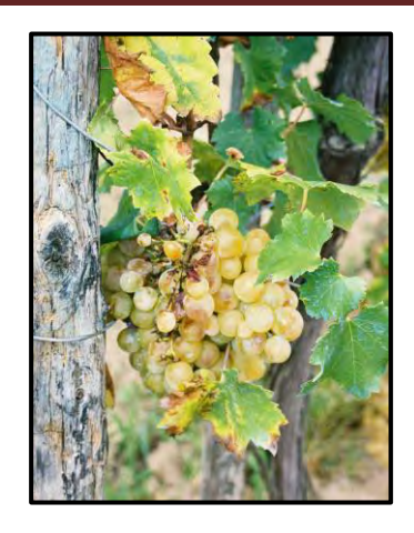
Near Greve in Chianti, Italy

Victoria Bergesen has a new street address: 1090 Otter Circle, Beaufort, SC 29902