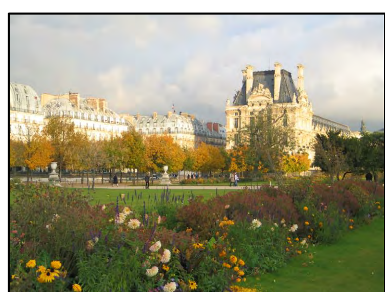
The Tuileries in Paris, France