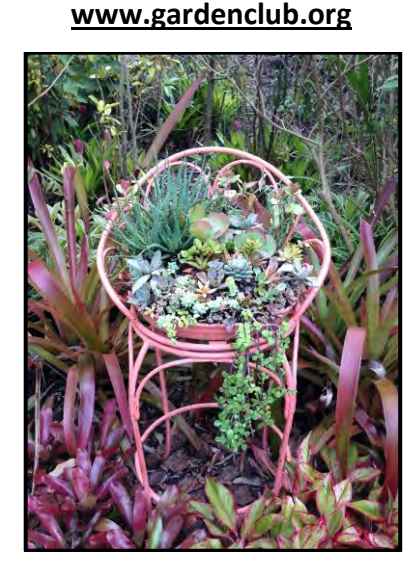
Naples Botanical Garden, Naples, Florida

PLEASE consult our website for the latest information on schools and refreshers: