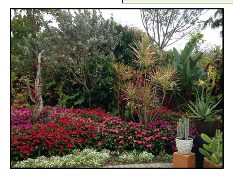
Naples Botanical Garden, Naples, Florida