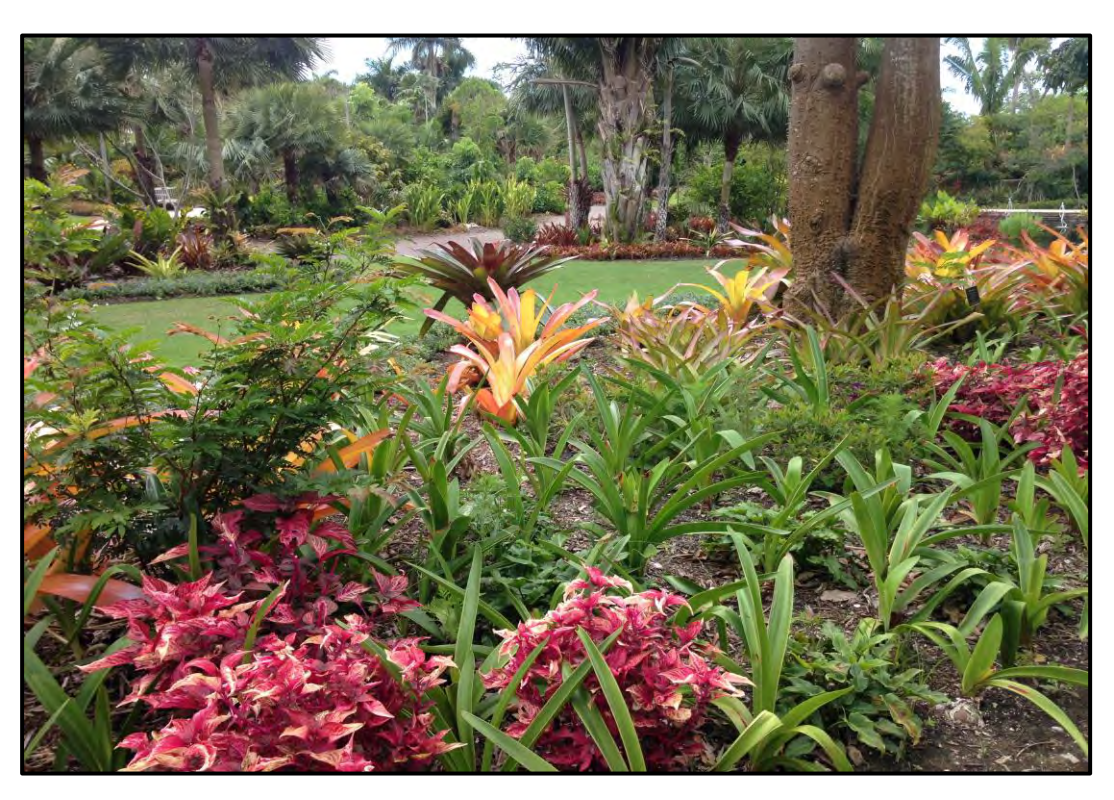
Naples Botanical Garden, Naples, Florida