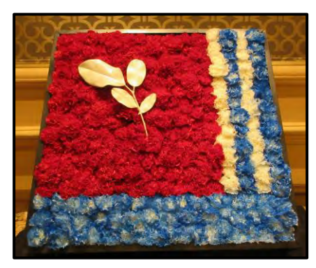
Tribute Design at NGC Convention in Biloxi

As I write this in mid-August, I was concerned a few days ago that there should be more Landscape Design School Courses on the calendar. Then we received four registrations all at once. I'm hoping that as states and districts and clubs are ending summer breaks and getting back to the activities of garden club that they will consider the value and benefit of including plans for a Landscape Design School on the calendar for the new garden club season.