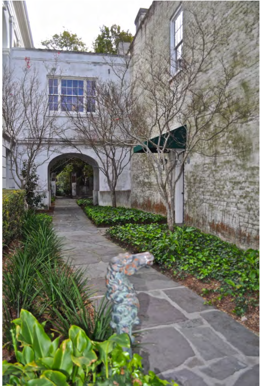
Garden Walk of the Garden Club of Charleston. Charleston, South Carolina.