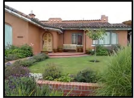
Home of Alison Arkley.

The Eureka Sequoia Garden Club continued its Front Yard Landscape Contest by naming "Six Jewels on G Street." In August, two garden club members viewed and evaluated all of the properties along the 39 blocks of G Street in Eureka. If a pro-