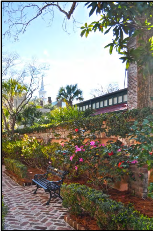
Charleston, South Carolina, February 21, 2013.