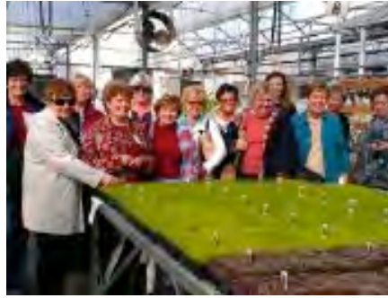
Touring one of the new state-of-the-art greenhouses at Meadow View, New Carlisle, OH.

gardens. Twenty-eight people attended with fifteen taking and passing the exam. We always do an optional fun yet educational tour in addition to our regular lectures, and this time we went behind the scenes of Meadow View Garden Center and Landscape Design, in New Carlisle.