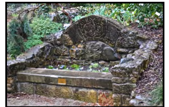
Page 1 Window Box, Charleston, SC. Rotary International Garden, Janesville, WI Page 2, top 3 Japanese Garden; bottom Celtic Bench.