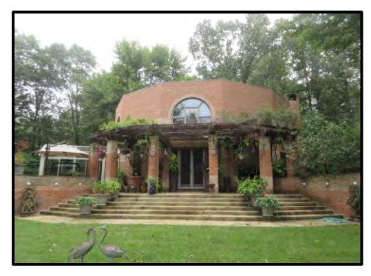
The Twelve-Sided House

In September, the Landscape Design Council of the National Capital Area toured an impressive 10-acre private Persian Garden in Huntington, MD. The extensively landscaped garden includes koi ponds, boulders and a stream. In the spring, there is a burst of color from over 10,000 bulbs -tulips, daffodils and hyacinths – that were planted by our host and homeowner. A Persian Garden follows specific guidelines using geometric shapes and principles and has a water feature in the middle.