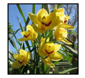
Orchids at Hillwood, Estate Wash., DC.

text. A supply of the text is readily available from Member Services. After July 1, there will be no official text and each instructor will teach from their own outlines which will expand on the required subjects.