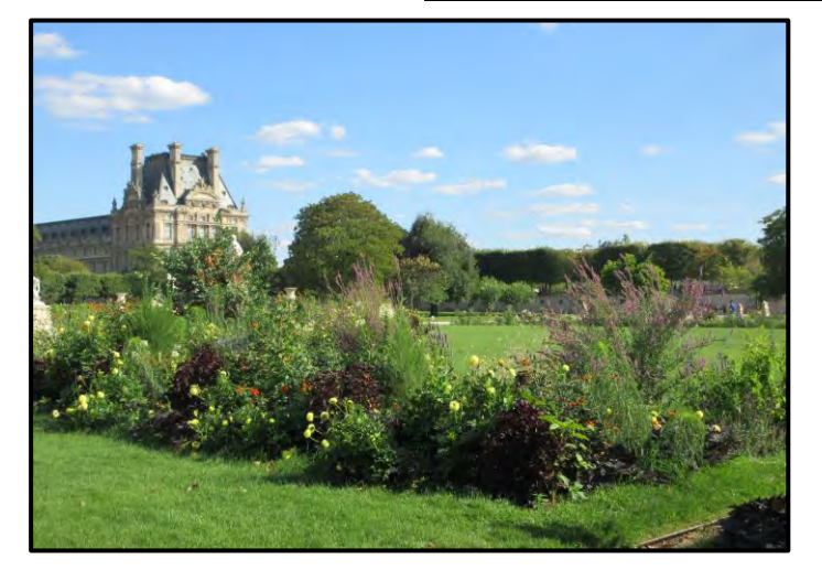
The Tuileries, Paris, France