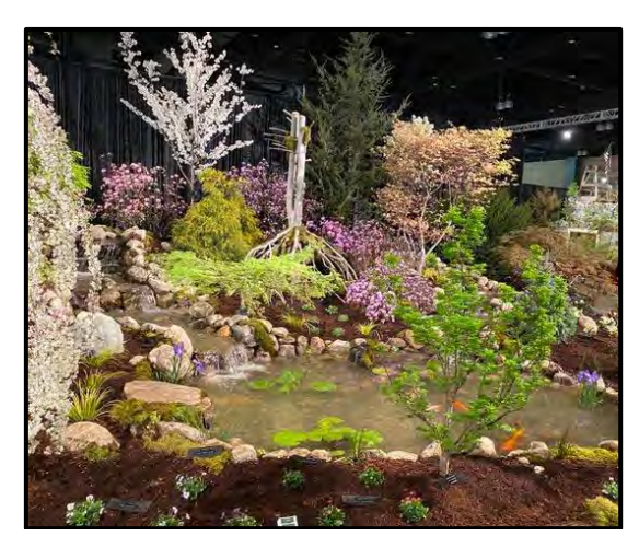
In this same landscape, the logs provided texture and line to delineate their space.

Line can also make a statement as a dominant feature in a landscape, like the use of this cylindrical, barren tree in the center of this landscape. The use of texture in the plant material was superb!