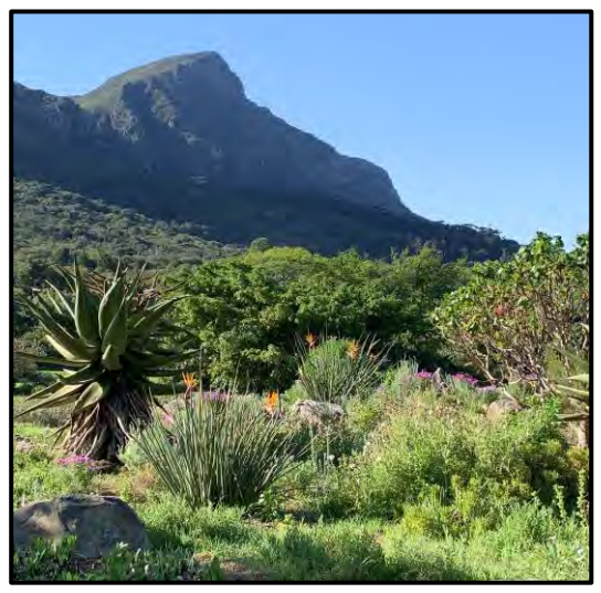
Kirstenbosch Botanical Garden, Cape Town, South Africa