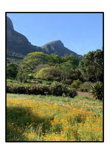
Kirstenbosch Botanical Garden, Cape Town, South Africa