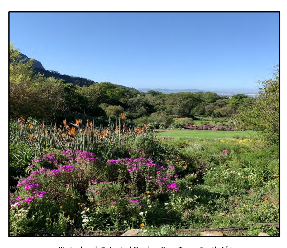
Kirstenbosch Botanical Garden, Cape Town, South Africa