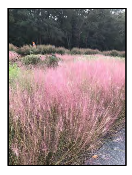
Pink Muhly grass

Educational, inspirational and sustainable aptly describe the mission of the Delaware Botanic Gardens which covers 37 acres of meadow, woodland and wetland. Located on the peaceful Pepper Creek, the public gardens formally opened just a week before our tour. We strolled through the sunny meadow admiring the swaying grasses; my favorites are the pink muhly grasses and native wildflowers designed by the renowned Piet Oudolf. We ambled along the woodland path bordering Pepper Creek surrounded by towering black cherry, sassafras and tupelo trees. A stunning focus were the giant birds' nests, crafted by volunteers. Actually - more people's nests, than birds' nests.