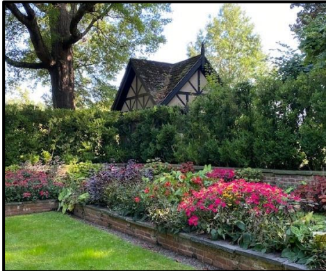
Gillette’s sunken garden with summer blooms.

Pollarded linden trees line the walkway from the garden to the rear stone terrace, which offers a lovely view of meadows leading down to the historic James River. Many summer plants were still in full bloom throughout the garden. Pink Japanese anemones ( Eriocapitella x hybrid ) provided fresh blooms along walkways. It was a day of education, inspiration and new friendships.