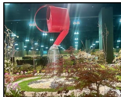
The suspended, oversized watering can give the space drama and intrigue.