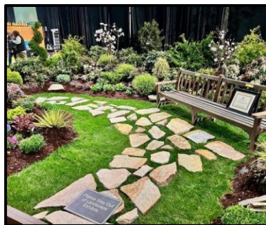
A nice use of void (grass), textures and repetition by the Horticulture Club.