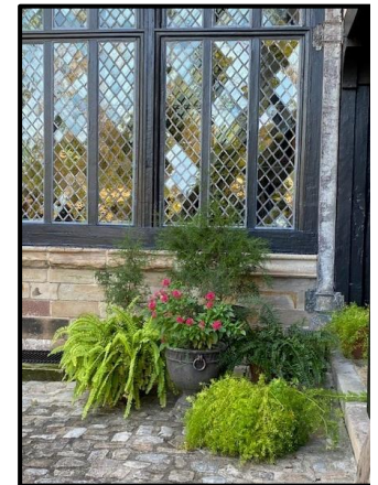
Agecroft’s courtyard entry. Note the glass windows from the 1600s.