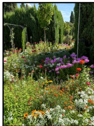
Photos at Generalife Gardens in Granada, Spain