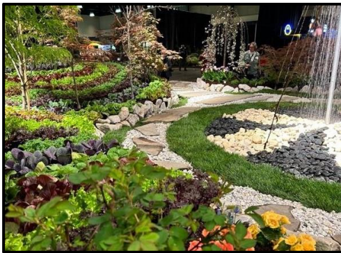
The precise placement of lettuce makes a beautiful display of texture, color, mass and line.