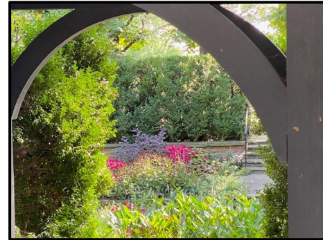
Gillette designed gardens as rooms.

landscape architect in the early 1900s. In maintaining the integrity of the Tudor style home, Gillette designed the Tudor gardens as outdoor rooms, or as an extension of the house. His sunken garden, reminiscent of the one at Hampton Court Palace, was originally all green but today changes seasonally with new plant material and color. A knot garden is filled with herbs intricately parterred within squares, which were intended to mimic threads in ancient Celtic knot work.