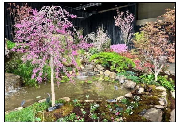
The winning landscape by AquaScape had nature at the forefront with the lovely pond.