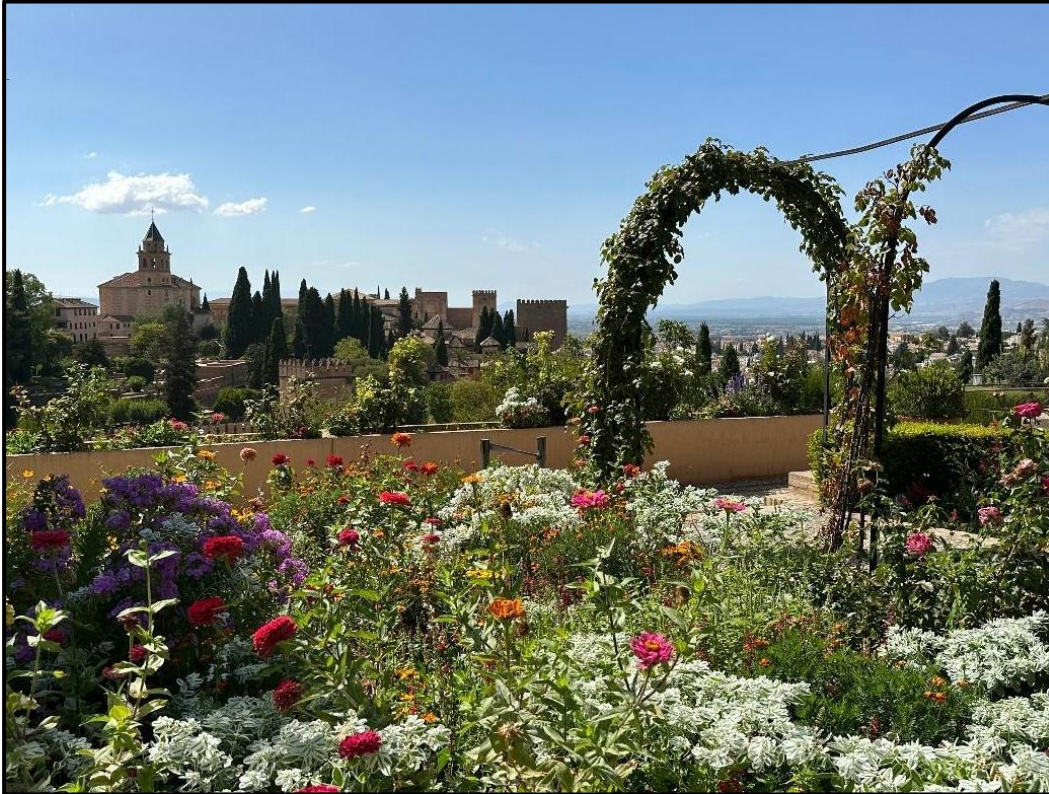
Generalife Garden in Granada, Spain