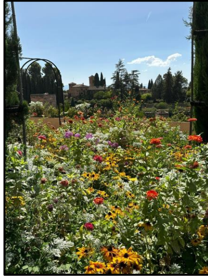
Generalife Gardens, Granada