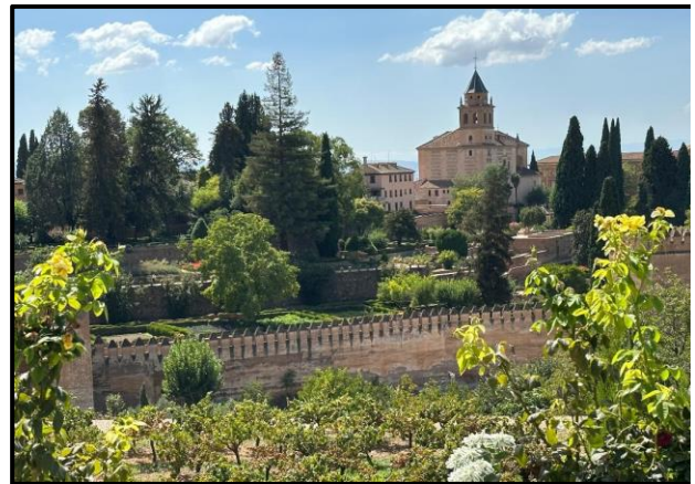
Alhambra, Granada, Spain

An individual passport is $49. A family passport, covering two adults and up to three children ages 17 and under, is $99. Passports are valid anytime between