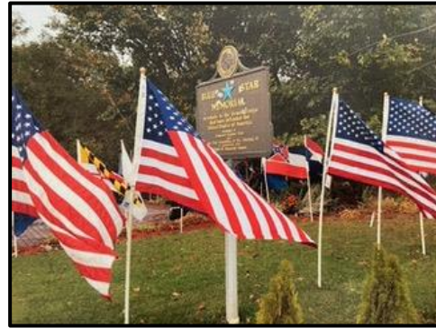
Sheila Croushore, Co-chair Laurel Highlands LDC

The Flight 93 Chapel and Children’s Peace Garden are visited daily.