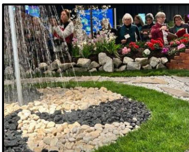
Connecticut LD Council during the judging process.