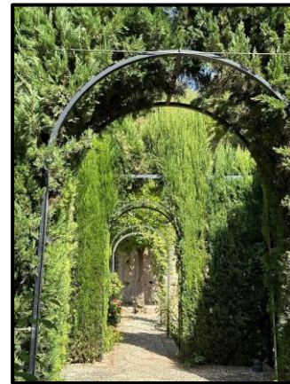
Arched Walkway at Generalife Gardens, Granada, Spain

you do not receive it, request that information from your State School or Credentials Chairman. Students and consultants no longer receive certification cards, so you need updated Forms 6 (students) or 7(consultants) to register for your next course or refresher. Keeping track of your own records ensures that your Forms do not become “lost”!