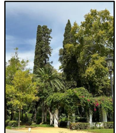
Maria Luisa Park, Seville, Spain