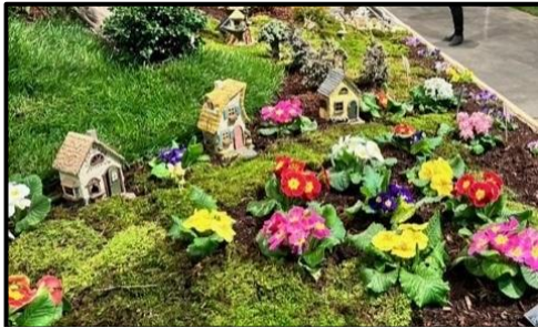
Landscapes come in many sizes. This miniature landscape had many vignettes and was fascinating for all ages.