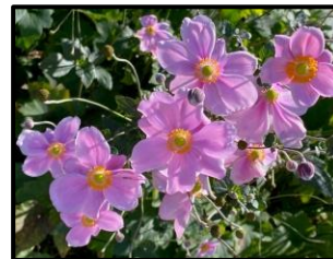
Fall blooming anemones

One unique garden was inspired by and dedicated to John Tradescant, The Younger, who in the 1600s traveled to Virginia collecting plants for Queen Henrietta Maria of England. The garden features a variety of the collected native plants based on Tradescant’s meticulous recordkeeping.