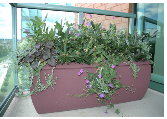
SIPS, or self irrigated planter systems, are engineered to slowing release water from the bottom of the planter, reducing watering requirements and eliminating messy runoff.

• Trees offer an incredible opportunity to combat climate change in our cities by absorbing carbon dioxide and other pollutants, releasing oxygen, cooling the