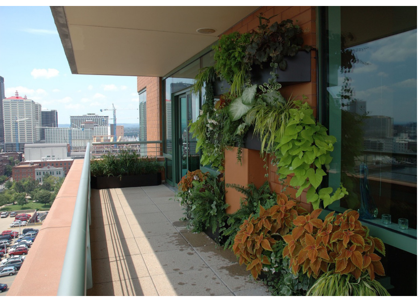
Drip irrigation and vertical planters of the author's design allow for a colorful and dynamic garden in a very small footprint, perfect for city living.

The benefits of green infrastructure are best achieved through the additive effect of varied projects. What is so particularly exciting about urban greening is that, like drops of water accumulating in a rain barrel, together many smaller projects add up to