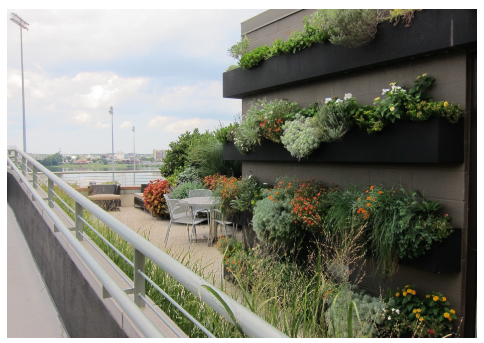
The same green wall in autumn when annuals mixed in with economical perennials reduce maintenance and enhance a beautiful spot to enjoy the last warm days of the season. These urban green spaces offer a respite from the demands and stresses of city living.

When planting on balconies and in areas where planters are required, careful attention must be paid to their size and shape. The larger the better, as the increased soil volume will add thermal insulation both in summer and winter and also offer better moisture regulation. Square or rectangular planters offer more stability than those with narrower bases, and all should be securely fastened to prevent toppling, or worse, becoming airborne. The turbulence and velocity of the wind may be unpredictable in the city as it torrents, gusts, and uplifts between buildings. Plants, too, should be secure in their pots, and gravel mulch may prevent soil from being scoured out of planters by the wind. The material of the planter is also an important consideration, as their