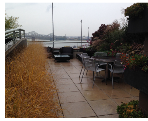
Native switch-grass (Panicum 'Heavy Metal') and our native bamboo (Arundinaria gigantea) add a special winter-interest to this garden, six-stories up, and overlooking the Ohio River.

• Include native species, which are well adapted to varying pH, nutrition, and soil conditions and typically boast deep and extensive root systems, which support the plant through typical periods of drought and the extremes of an urban environment. Be willing to experiment with rambunctious and riotous plantings that might offer blooms for pollinators over a long season. Don't discount the efficacy of self-seeding annuals,