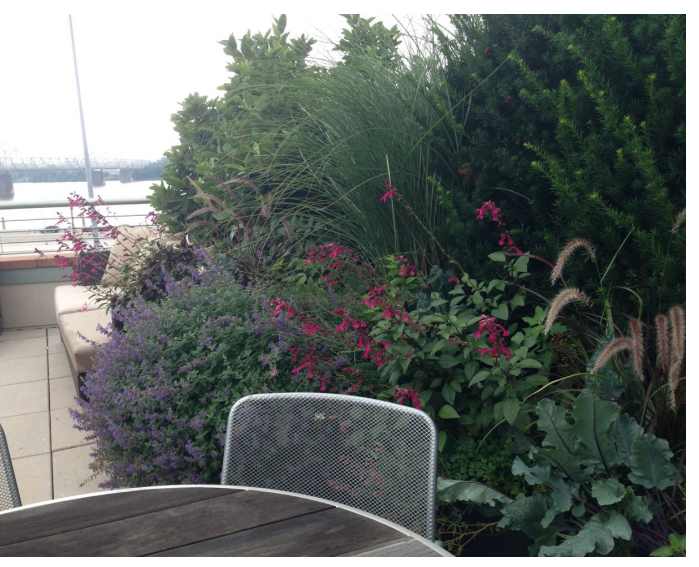
Salvia 'Wendy's Wish,' Viburnum 'Winterthur,' and Nepeta abound with late-season blooms and berries and offer a valuable resource for pollinators in the city.

those at ground level, give us an opportunity to significantly conserve this increasingly valuable resource. The drying effects of the wind and the increased heat in a city can destroy a planting in a few hours. A welldesigned watering system will ensure the success of the garden. Typically, projects factor in a drip-irrigation system, which need not be complicated or expensive. Many selfirrigating planters systems (or SIPS) are available to purchase or make and the In-