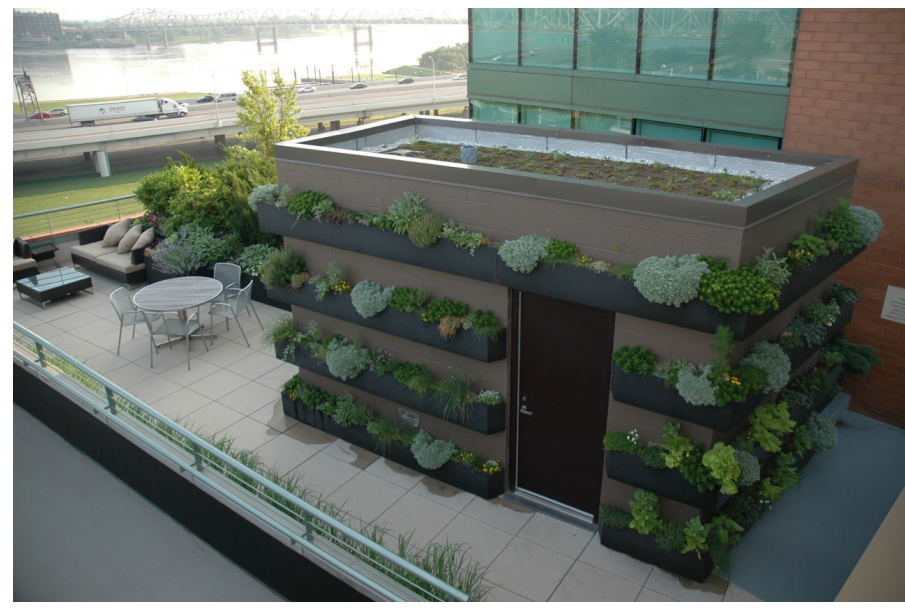
This green wall, in a city rooftop garden of the author's design, features a wide variety of edible plants for easy picking. Lettuces, herbs, and small strawberries are enchanting when viewed at eye-level. Drip irrigation supplies consistent moisture and the free-draining growing medium encourages the winter-hardiness of many species.

create a more livable and green city. We all have a part to play, and in lots of little ways we can crack open the impervious horizontal asphalt of our cities and allow green to spring forth. We can add soil to rooftops, peel away road mediums and sidewalks to allow water to slowly re-enter the groundwater supply through the filter of living plants and bacterium, without forcefully churning into our combined sewers, taking with it all sorts of pollutants and chemicals.