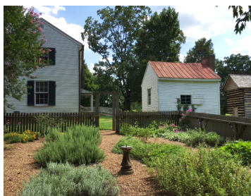
A sundial provides an architectural element in the restored kitchen garden. The Sam Davis home, outdoor kitchen and smokehouse are shown in the background.