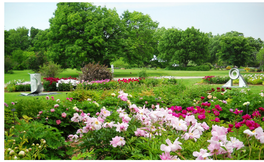
Boerner Botanical Gardens, site of the Tri-Refresher.

Make your plans today to join us at Perfect Vision 2020, where you will experience the hospitality of Wisconsin and discover all the best of Milwaukee!