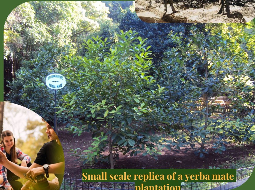
Small scale replica of a yerba mate plantation