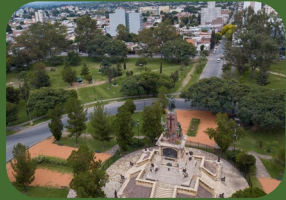
Salta Parque 20 de febrero