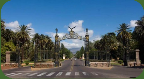
Mendoza Parque San Martín