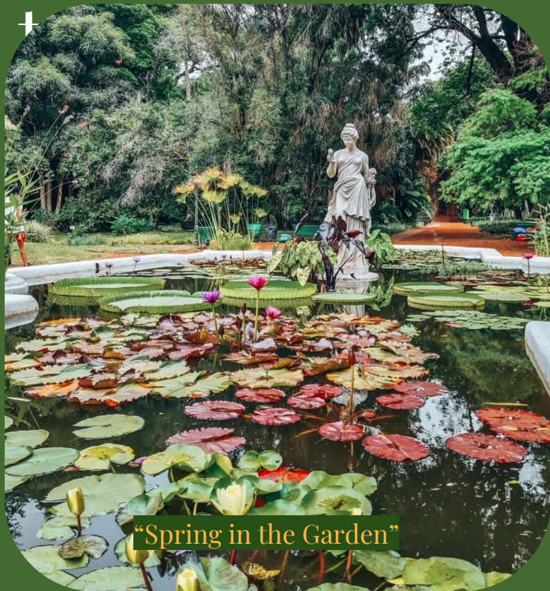
“Spring in the Garden”