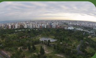
Córdoba Parque Sarmiento