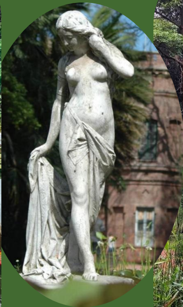
“Nymph of the Río de la Plata”