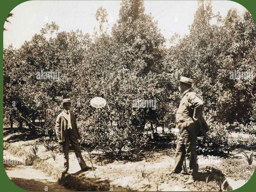
Carlos Thays in the yerba mate garden at The Botanical Garden