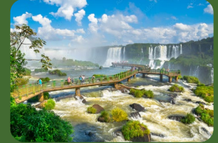
Parque Nacional Iguazú